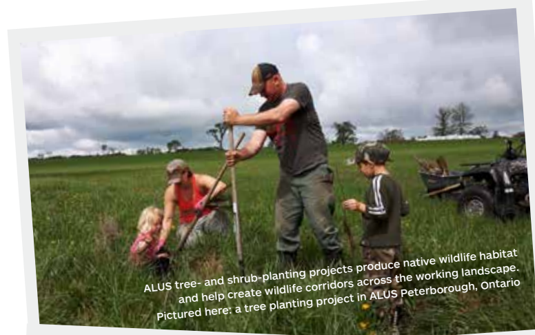
ALUS tree- and shrub-planting projects produce native wildlife habitat and help create wildlife corridors across the working landscape. Pictured here: a tree planting project in ALUS Peterborough, Ontario

How it Works: ALUS supports tens of thousands of acres of wetland, grassland and woodland projects across Canada. ALUS helps plant windbreaks, improve riparian buffer zones, create wildlife habitat and establish other types of beneficial projects that are suited to local needs and priorities.