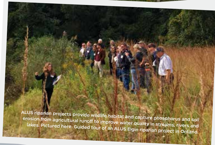
ALUS riparian projects provide wildlife habitat and capture phosphorus and soil erosion from agricultural runoff to improve water quality in streams, rivers and lakes. Pictured here: Guided tour of an ALUS Elgin riparian project in Ontario.