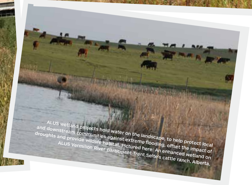
ALUS wetland projects hold water on the landscape, to help protect local and downstream communities against extreme flooding, offset the impact of droughts and provide wildlife habitat. Pictured here: An enhanced wetland on ALUS Vermilion River participant Trent Selte's cattle ranch, Alberta.